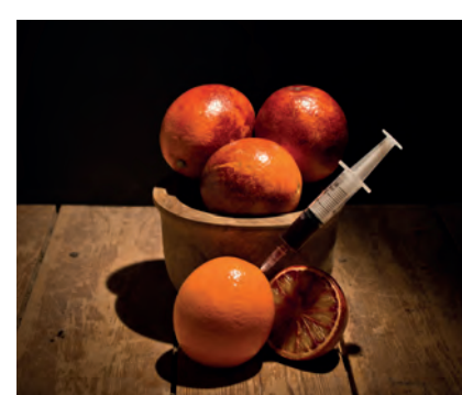
Lynn Dorey-Allen – Blood Oranges