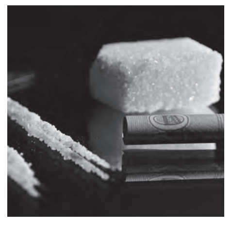
Black and white photography Lynn Dorey-Allen – Caffeine fix, Chocolate fix, Sugar fix